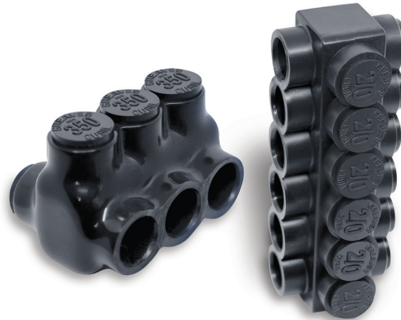
Two-Side Entry Multi-Cable USAD Series