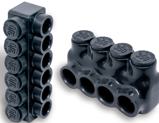
One-Side Entry Multi-Cable USA Series