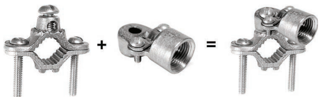
Application versatility: 4 Clamps + 4 Adapters = 20 Combinations

G41, G42, G43 UL listed when used on G1, G2, G12, or G13 clamp.