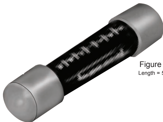
Figure 2 Length = 5 1/2