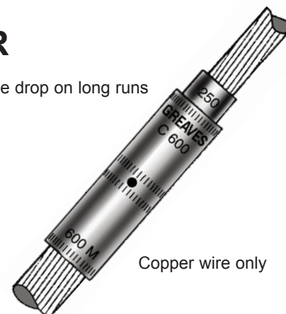
Copper wire only

CRK kits are designed for copper cable only. To splice an aluminum cable to a smaller copper cable, consult the factory for an ACK Kit (ASC-T splice with CRA insert), or use an AC-R Aluminum Reducing Splice or PT Adapter.