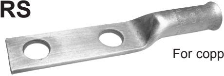
For copper cable

For flexible cable applications in locomotive, mining, marine, welding machinery, temporary power, wind power, and transformers Features flared Shoo-in™ barrel opening for easy cable insertion All L-NFX lugs have 1.75" max tang width to accommodate side-by-side NEMA stud spacing Copper, tin-plated for corrosion resistance