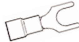
Vinyl Insulated Butted Seam