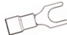
Nylon Insulated Sleeved Barrel