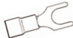
Nylon Insulated Sleeved Barrel