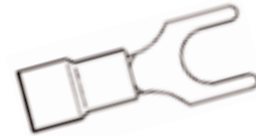
Vinyl Insulated Butted Seam