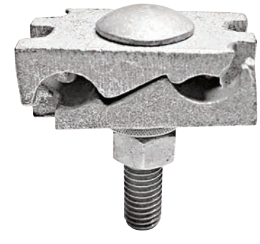
*CTGG 25-P Shown