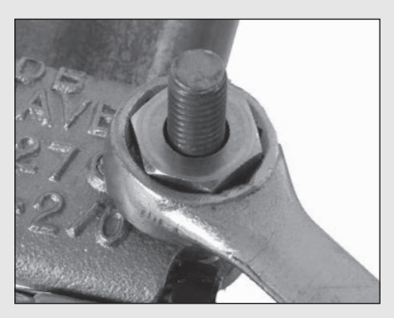
2. Tighten to shear-off hex