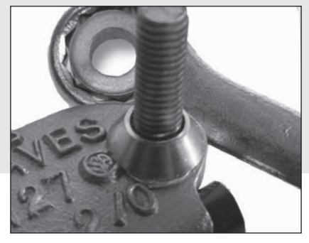
3. Remove hex head

Reliability – Tork-Away assures the proper installation torque, so the integrity of the electrical joint is inspectible and assured.