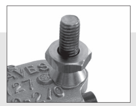
1. Screw on nut as shown

When the pre-set torque is applied, the hex portion breaks off. This is visual, inspectible proof that the proper torque has been applied. The result is a smooth conical shape which is virtually impossible to grip with any tool, so the connection is extremely tamper-resistant, vandal-resistant, and safe. Tork-Away security hardware is stainless steel nuts and/or bolts for maximum corrosion resistance.