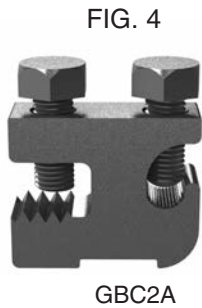
GBC2A Plated steel screws