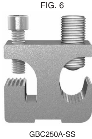
GBC250A-SS Stainless steel screws