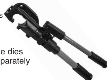
U-type dies sold separately