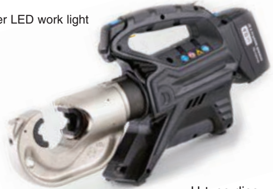
U-type dies sold separately

Next generation cordless hydraulic tool, with 18V Li-Ion battery OLED display shows real-time tool operating information: pressure, battery power LED work light Battery-powered hand-held tool for easy installation of compression connectors Two-speed action with rapid approach and slow speed for compression Lightweight construction, balance for one-hand operation Up to 200,000 crimping cycles Accepts all U-type dies, sold separately Operating temperature range: +5 to 122°F C-shaped head with large 1.65 opening for easy insertion of barrels up to 800MCM CU Includes tool, battery, spare battery, shoulder strap, 115VAC charger, and case with locations for 12 U-type dies