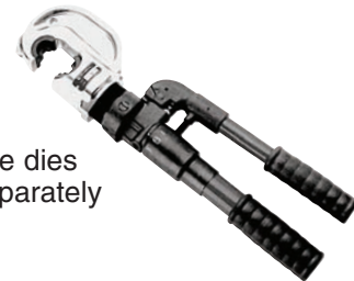
U-type dies sold separately

C-shaped head with 1.65 inch opening for 800mcm Safety-valve bypasses at max pressure Head can rotate 180 degrees for easy positioning on connector