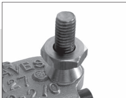
1. Screw on nut as shown

When the pre-set torque is applied, the hex portion breaks off. This is visual, inspectible proof that the proper torque has been applied. The result is a smooth conical shape which is virtually impossible to grip with any tool, so the connection is extremely tamper-resistant, vandal-resistant, and safe. Tork-Away security hardware is stainless steel nuts and/or bolts for maximum corrosion resistance.