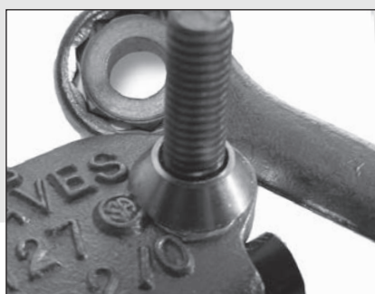
3. Remove hex head

Reliability – Tork-Away assures the proper installation torque, so the integrity of the electrical joint is inspectible and assured.