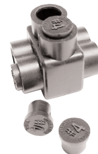
Wire entry optional from either side