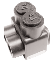
Both wires enter same side