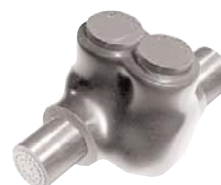
Opposite-side offset wire entry